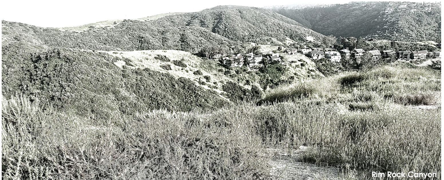
Rim Rock Canyon