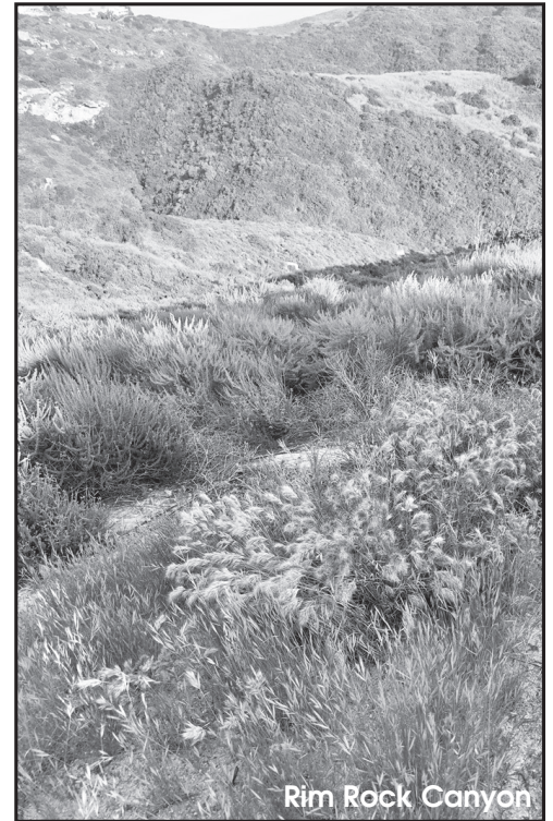
Rim Rock Canyon