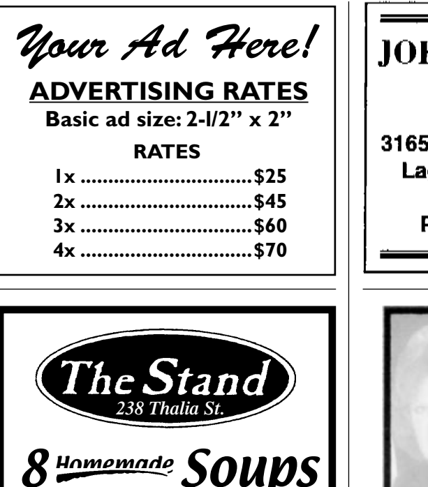
FREE Samples Lots of Parking