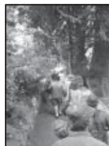
BPWA members on a walking tour of Thousand Oaks Paths

Recently we reviewed a newsletter of the Berkeley Path Wanderers Association, a grassroots volunteer group of community members who have come together