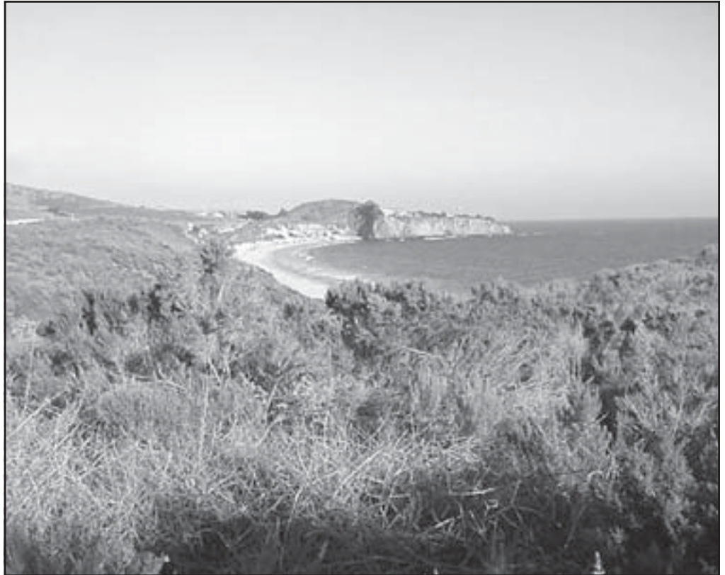
El Morro mobile homes are in the distance.